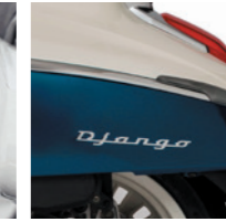
Chrome body panel trims