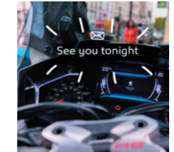
Receive your messages and notifications on the dashboard