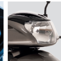
"Ice" effect LED light signature