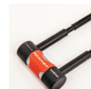
U-type SRA anti-theft lock