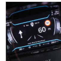
TFT colour screen