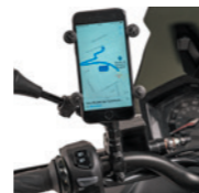
Smartphone fitting for RS