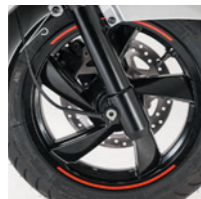
SBC (1) braking system