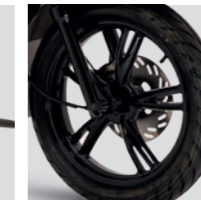
Large 16-inch wheels