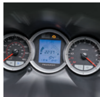
Dashboard with LCD screen