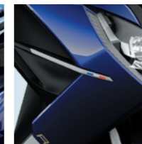
Manufactured in France