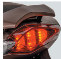
"3 strip" light signature