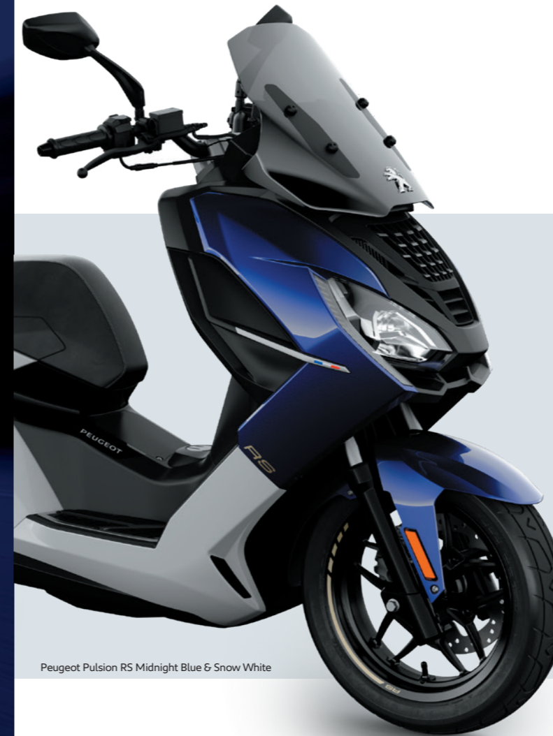
Peugeot Pulsion RS Midnight Blue & Snow White

See the city from another angle with Peugeot Pulsion! The Pulsion is the first model in the range to feature our integrated i-Connect® technology, inspired by the Peugeot i-Cockpit. This provides you with a unique and safe urban driving experience.