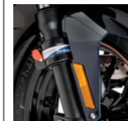
J-type anti-theft lock by SRA