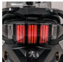
"3 strip" light signature