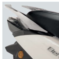
Passenger grab handle