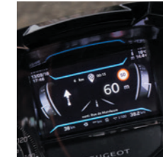
GPS on a colour TFT screen

See the city from another angle with Peugeot Pulsion! The Pulsion is the first model in the range to feature our integrated i-Connect® technology, inspired by the Peugeot i-Cockpit. This provides you with a unique and safe urban driving experience.