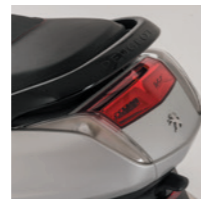
Passenger grab handle