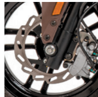
SBC (1) braking system